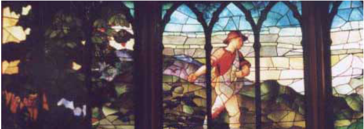
The Sower at Channing Memorial, Newport, RI

Committee Of Chairs Gathering: Potluck and Meeting for committee chairpeople to share goals, challenges, solutions. Thursday, November 3rd, 5:30 to 8:30. Contact your ministry coordinators.